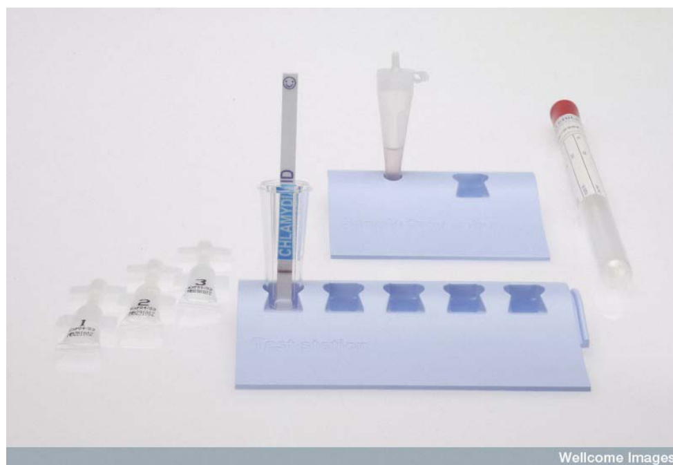
Figure 1 The Rapid Chlamydia test, showing test strip with a result line indicating the presence of chlamydia

The Rapid Chlamydia urine test requires subjects to provide a urine sample, collected using the FirstBurst urine collection device which collects the first 4-5 ml of urine. The urine is diluted with distilled water and centrifuged. The supernatant is discarded and the pellet is extracted by the sequential addition of the three kit solutions. A fraction of the extracted sample is added to a tube which contains lyophilised amplification and detection reagents. After mixing, the test strip is added to the solution and incubated at room temperature for 25 minutes (Figure 1). The test strip is embedded with a monoclonal antibody to chlamydial lipoploysaccharide. If chlamydia is present in the sample a line appears on the test strip (Nadala et al 2009).